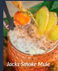
Jacks Smoke Mule